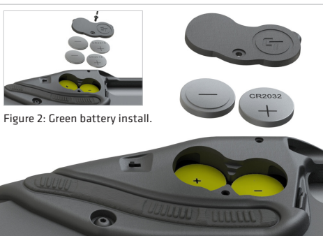
Figure 2: Green battery install.