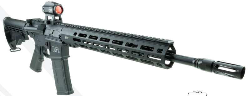
CTS-1000 UPC: 850002469035